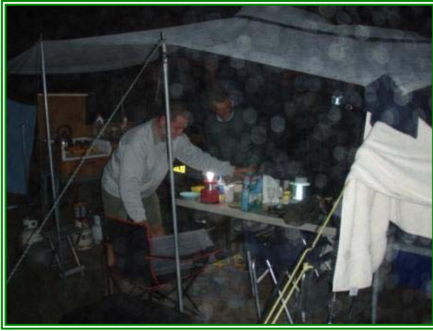
Breakfast, early Sat morning.

the last of our trio to land a fish, a tough THREE (3!!) hours or so before I got my 1 st fish for the day, a healthy little bass of 202mm on a small, black spinnerbait with a gold blade. I started with 3 outfits on board – the small black spinnerbait on the baitcaster, small buzzbait on the L spin and small crankbait on the UL spin. I actually had a couple of slurps on the buzzbait, but no hookups. I soon removed the buzzer for other lures.