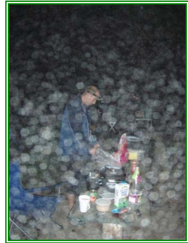
It's not snowing, but the camera flash catches the fog and moisture in the air