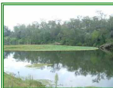
salvinia & water hyacinth