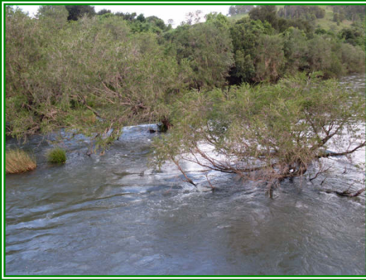
some nice looking Bass water

The reach down from Killawarra bridge was new to us so we started with much enthusiasm, but it wasn't long before we realised that it was going to be a tough day at the office. The river had a bit of colour after the recent floods but the Bass were in shut down mode. Gordon's barometer told the story. Never mind, just keep casting and stay positive.