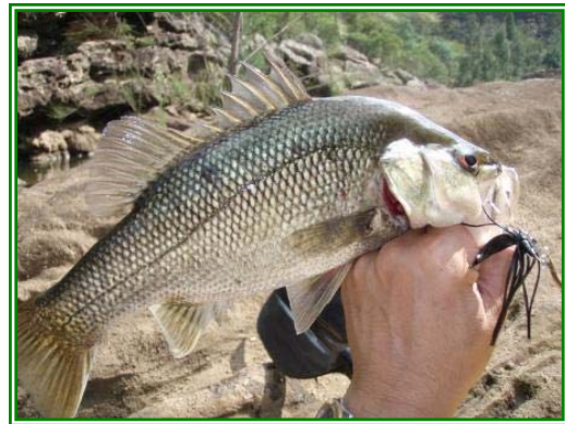
314 mm spinnerbait muncher

I got back to the weir and dragged my yak up and over it and was back in Reach 3A by around 6:30pm. Paddling back to the bridge took me another hour with some more fishing thrown in. I was to finish with the last fish of the day, from just downstream of the bridge. Total: 13 fish for the day, with 12 coming after lunch; 12 hours' effort. The total number of lures used, 16, with only 2 being successful. Cost: 2 x Crickhoppers and pair of polarized sunnies. In spite of the S-L-O-W start, I enjoyed my BassCatch. Now, I better look for some cheap Crickhopper clones before I get out again!