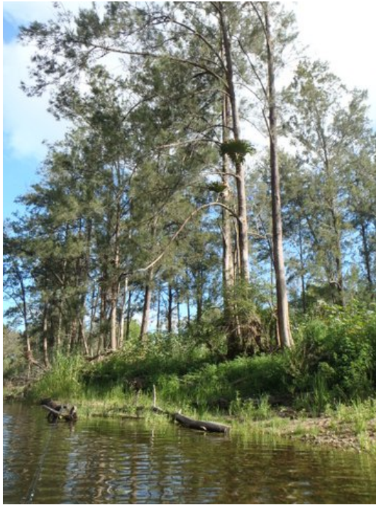
Stags high up

covered with Stag and Elkhorns, magnificent. Also caught plenty of fish, all on surface, had heaps of missed strikes and dropped about as many as we landed, no real size to them but was great fun.