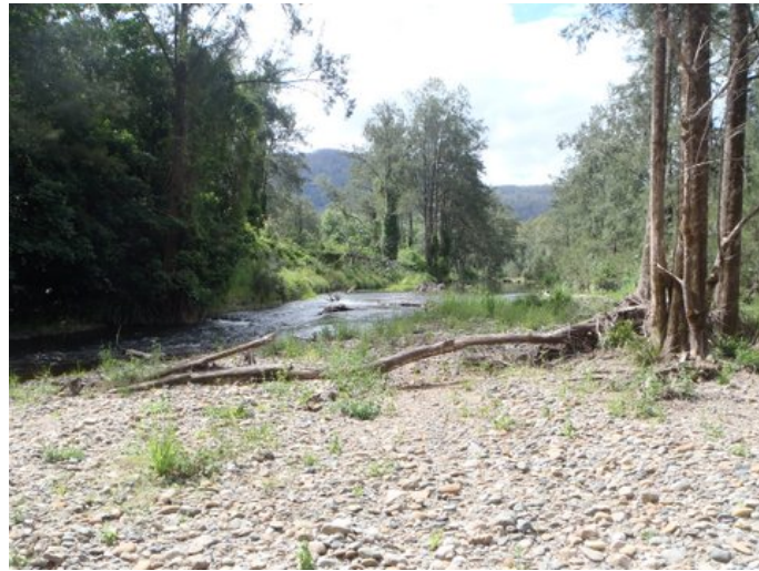
Water level very low