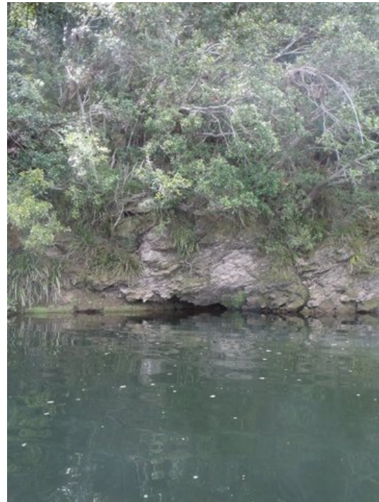
What you see when the levees are down