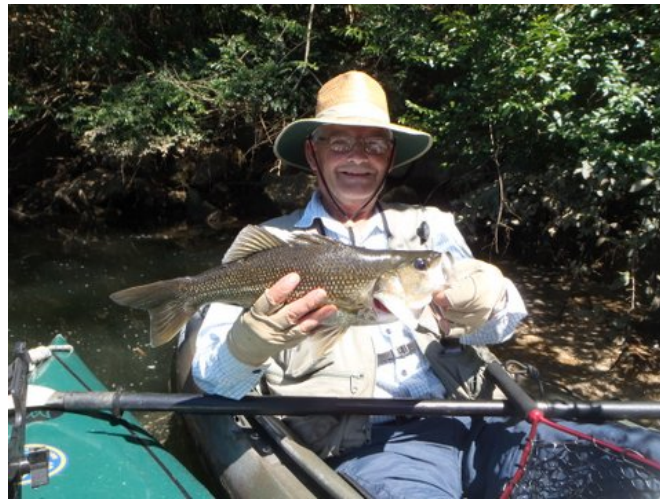
Biggest fish of the trip 408mm.