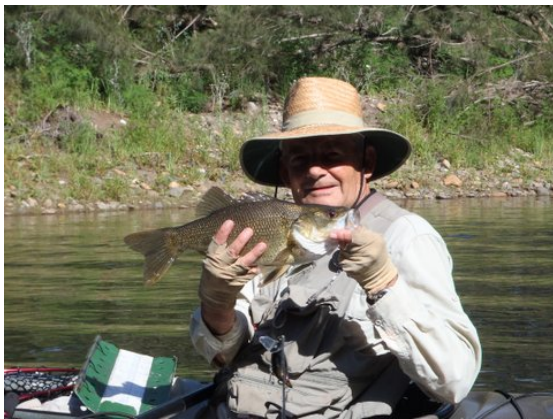
Just on 400

Not only arty but also very forthcoming when they found out we were there to catch “Perch”, offering much info as to where we might go. We decided that on day 1 we would drive upstream to see what was the go, the river was down quite a bit and although there is plenty of access upstream there was very little water, more portaging than yakking we figured. We did find 1 bridge with a nice looking pool and could not resist it, so off with the yaks and away we went. We caught a couple of fish in this pool, it looked really fishy, the best being a bruiser just nudging the 400 mark.