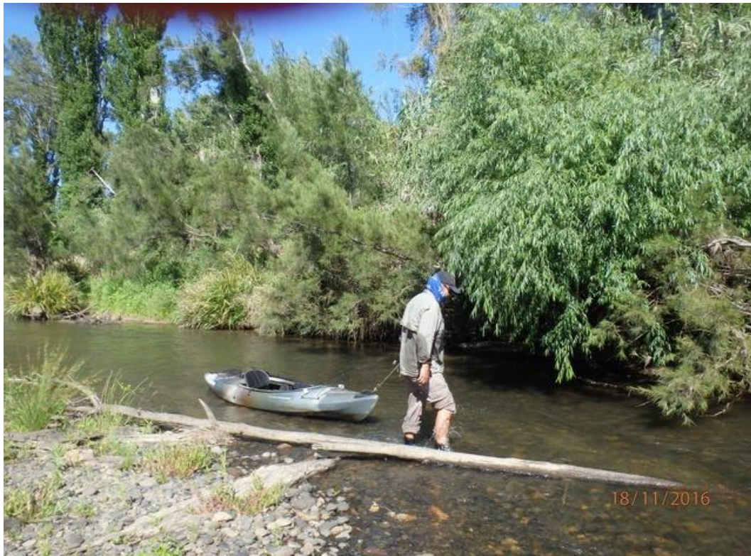
My little bass on SSC to blood new rod -